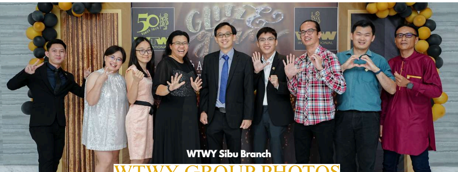
WTWY Sibuluan Branch