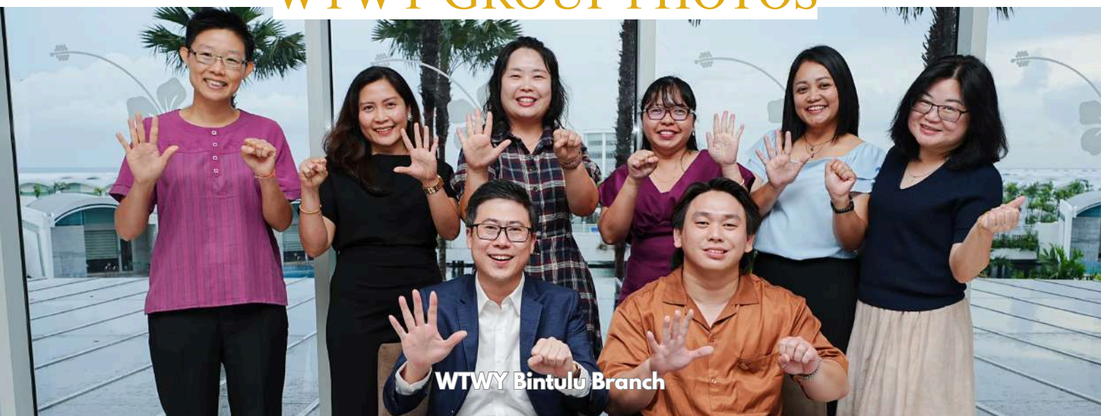
WTWY Bintulu Branch