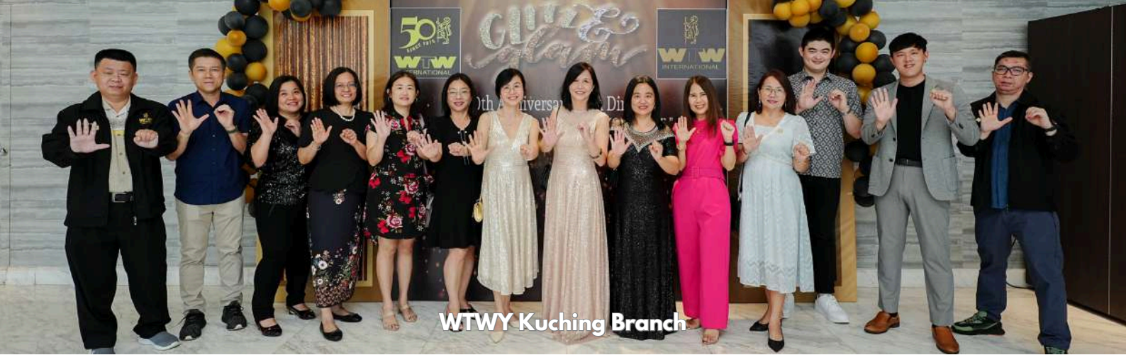
WTWY Kuching Branch