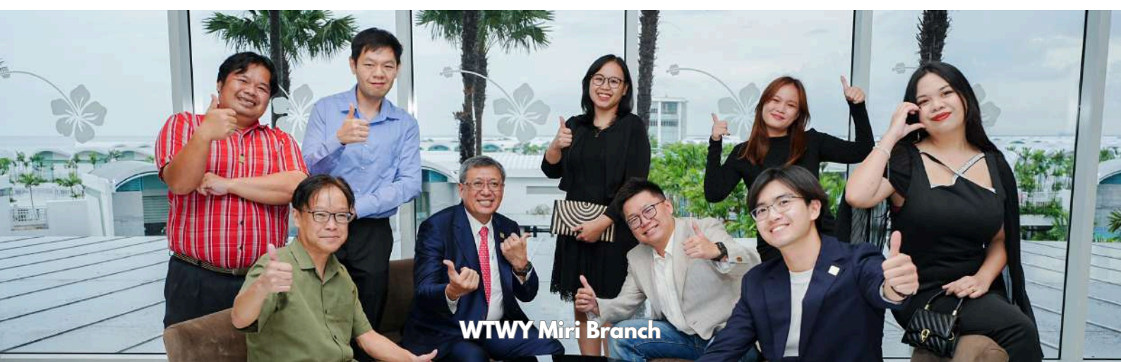
WTWY Miri Branch