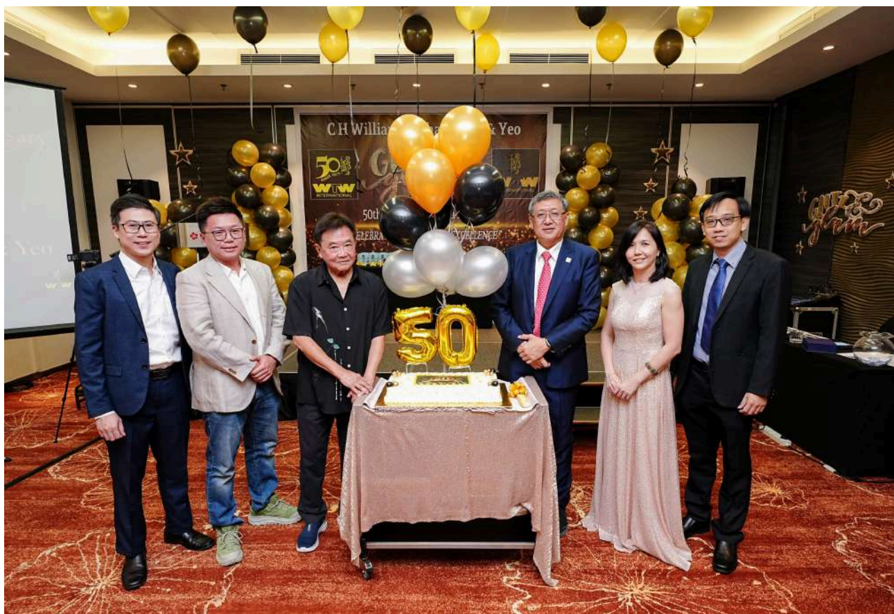
Chairman & Board of Directors gracing and officiating WTWY's 50 th Anniversary Celebration