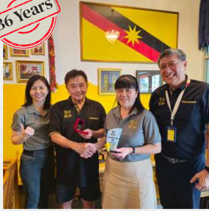
Kueh Siaw Ling